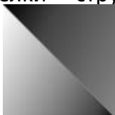
satin iron grey