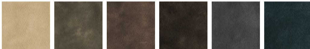
SN01 ZENZERO SN03 ARGILLA SN04 TERRA SN05 VISIONE SN06 VULCANO SN17 NOTTE