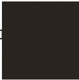
891 TESTA DI MORO