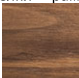
NC американский орех