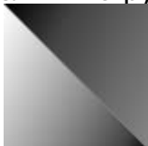
satin iron grey