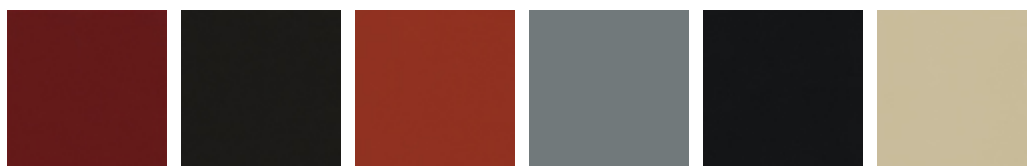
89 ROSSO CORSA 91 TESTA DI MORO 92 LOBSTER 94 SCABETICO 96 BLUE OCEANO 97 PANNA