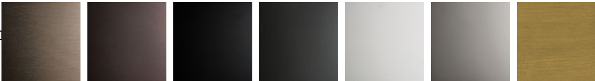
11 satin titanium, 15 satin bronze, OP17, P69, P71, gold finish