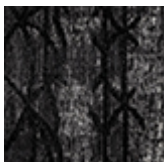
хлопковой синели Mumbai