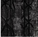
00000000 000000 Mumbai