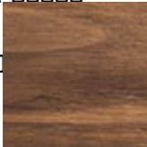
NC Materiali naturali