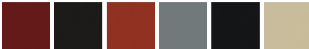
89 ROSSO CORSA □□□□ □□□□ 91 TESTA DI MORO □□□□ □□□□ 92 LOBSTER □□□□ □□□□ 93 ARTICO □□□□ □□□□ 96 BLUE OCEANO □□□□ □□□□ 97 PANNA □□□□ □□□□