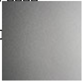
14 silver met