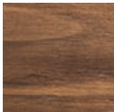
NC американский орех