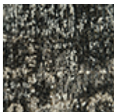
хлопковой синели Мароон