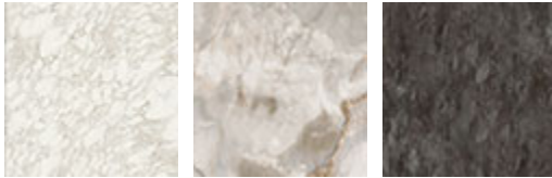
KM01 Calacatta KM02 Alabastro KM04 Ardesia