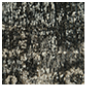
Mapoon ? ? ? ?